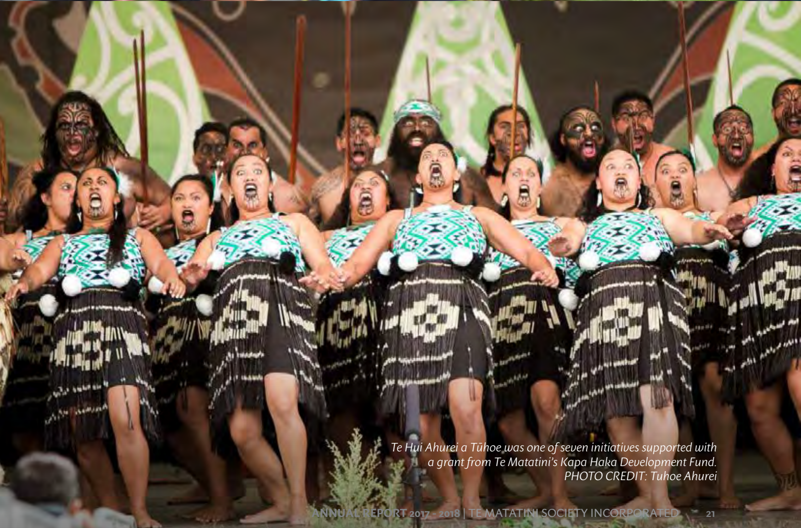
Te Hui Ahurei a Tūhoe was one of seven initiatives supported with a grant from Te Matatini’s Kapa Haka Development Fund.