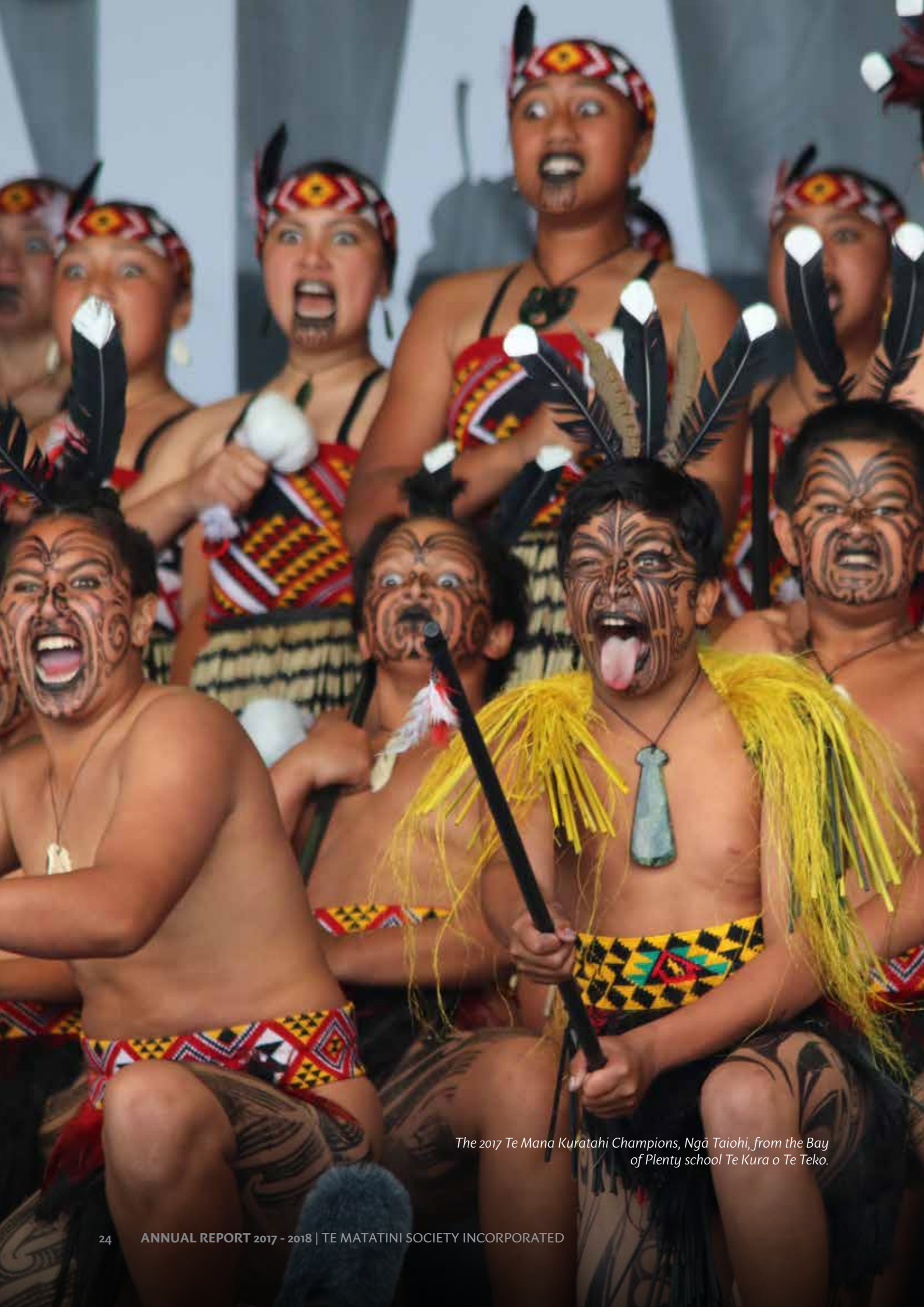
The 2017 Te Mana Kuratahi Champions, Ngā Taihi, from the Bay of Plenty school Te Kura o Te Teko.