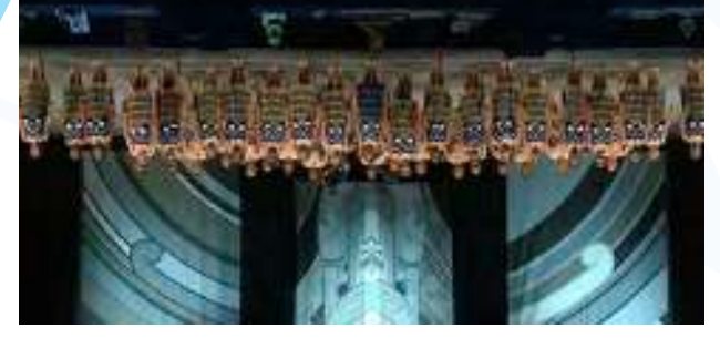
Toawhakaihuwaka – Te Kura o Te Pāroa

He toa ngā kura katoa ka whai wāhi ki Te Mana Kuratahi, engari kāore he rerekē a Te Mana <mark>Kuratahi ki</mark> ētahi atu whakataetae he taonga tapu kei roto hei whakataetae. Ko ngā toawhakaihuwaka <mark>me ngā kura</mark> i whakawhiwhia ki ngā tūranga toa i te tau 2019 ko: