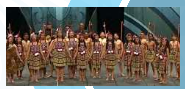
Third place – Te Wharekura o Ruātoki

Te Mana Kuratahi (TMK) Kapa Haka was hosted by Tainui in August 2019 in Hamilton. 65 Kapa Haka participated at the event, an increase of 10 teams from the 2017 event held in Tairāwhiti.