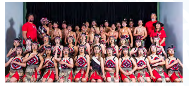
Runners Up – Te Whānau o Te Maro