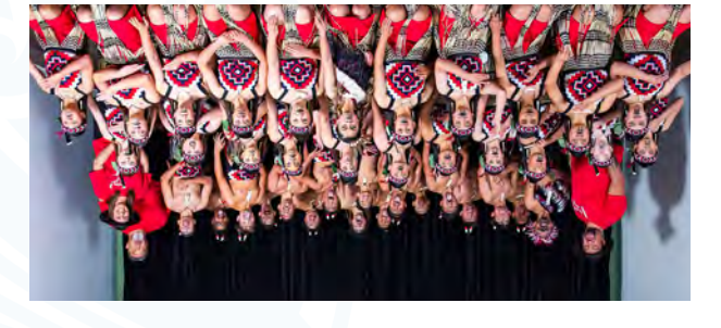
oreM aT o uenādW aT – eureuT egneruT

Ko Tainui te mana whakahaere o Te Mana Kuratahi (TMK) ko te Whakataetae a Motu mõ Ngā Kura Tuatahi ka tū ia rua tau. I te tau 2019 i tū ki Kirikiriroa. E 65 ngā rõpū kapa i tū ki te whakataetae ā motu he whakapikinga mā ngā kapa 10 mai i te whakataetae i tū ki Te Tairāwhiti i te tau 2017.