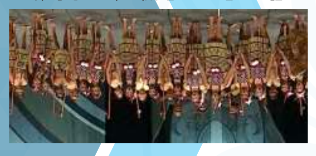
Teranga Tuatoru – Te Wharekura o Ruātoki