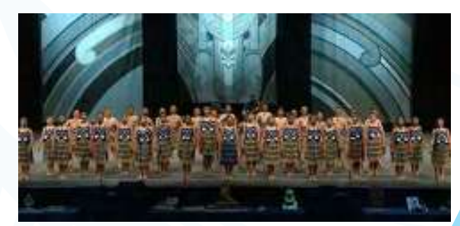
First place – Te Kura o Te Pāroa

All teams that participate in Te Mana Kuratahi are recognised as winners but with every competition there are precious taonga to strive for and Te Mana Kuratahi is no different. The winners and place getters of these trophies in 2019 were: