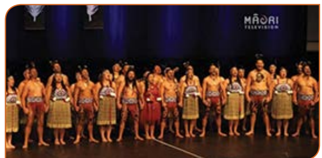
Te Reanga Morehu O Ratana

We continue to foster engage and support kapa haka at all levels throughout Taranaki and Whanganui. We are constantly working to improve our systems to ensure the survival and uniqueness of our art-form is maintained for current and future generations.