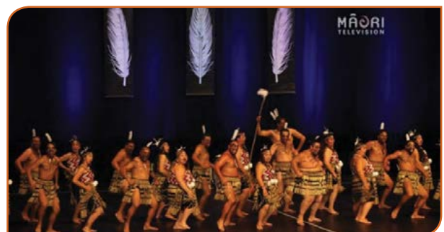
Nga Purapura O Te Taihauauru

Me tū kaha, me tū manawanui e ngā kapa haka katoa kia pupuri tonu atu ai ki ngā mahi a ngā mātua tūpuna, mā rātou e arahi e hapai. E te whānau o Waitaha, o Kai Tahu hoki, mā Te Atua tātou e manaaki e tiaki hoki. Tēnā anō tātou katoa, mauri ora.